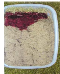
Typical Wetting Agent