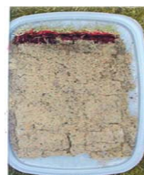
WITH WATER ONLY