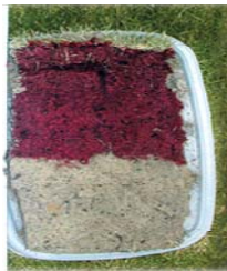
Penetrating Action with Premium Turf Penetrator GT