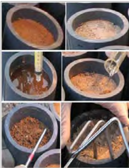
AZ (left) and NV (right) soil columns before and after product application.

The use of dust suppressants not only enhances dust control but can also significantly reduce the amount of water needed to effectively control dust. However, application of dust suppressants could also negatively impact the quality of underground water and surface water bodies through infiltration or storm water runoff.