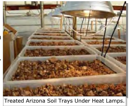
Treated Arizona Soil Trays Under Heat Lamps.

soil plots treated with six dust suppressant products was evaluated for water quality and aquatic toxicity. The study also evaluated the quality of water leached through soils treated with dust suppressant products. The study design replicated, to the extent possible, conditions under which dust suppressants are typically applied at construction sites in desert climates.