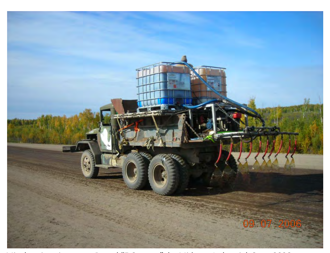
Minchumina airport. Rental "E-Sprayer", by Midwest Industrial, Sept. 2006.