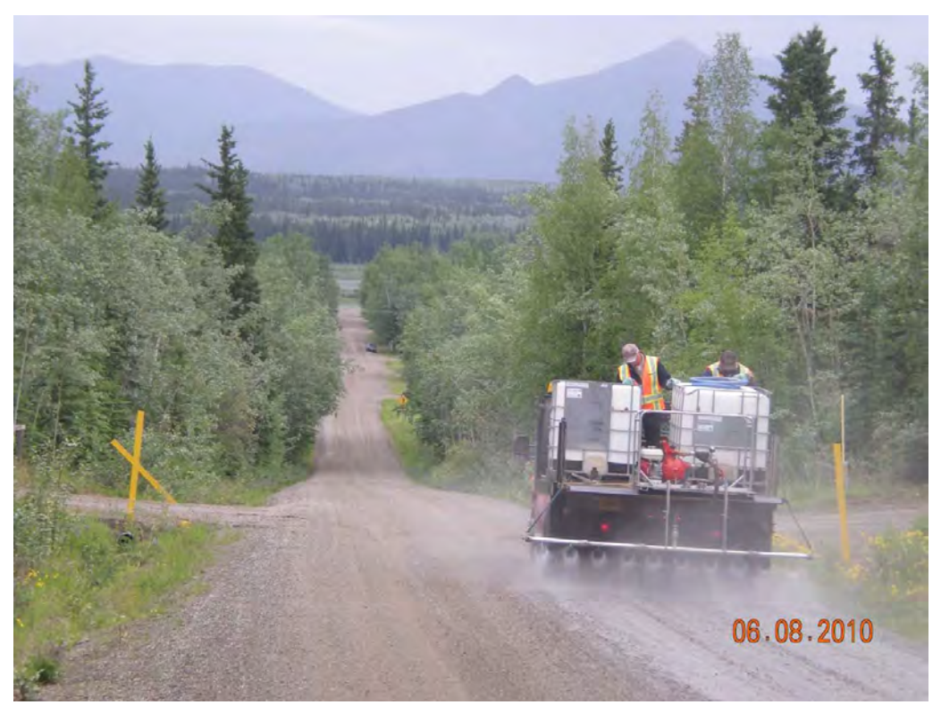
Eagle. Spring 2010, with an "Alaska Sprayer".