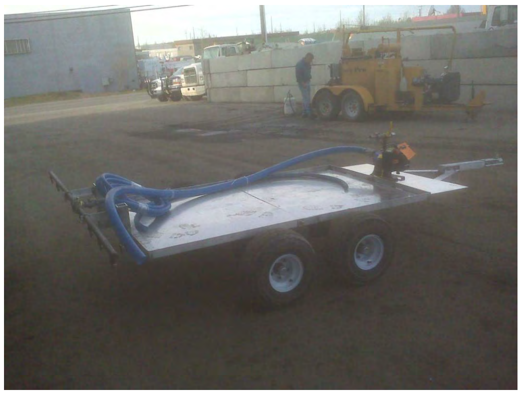
Apun LLC "Sprayer-Trailer", delivered to each of 8 villages: average cost = $8,000; ready to assemble at village