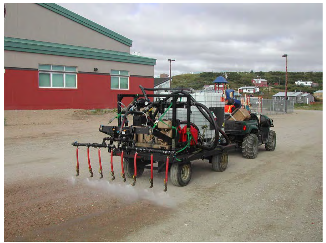
Golovin. Kawerak applying in 19 Western villages (2006 & 2007).