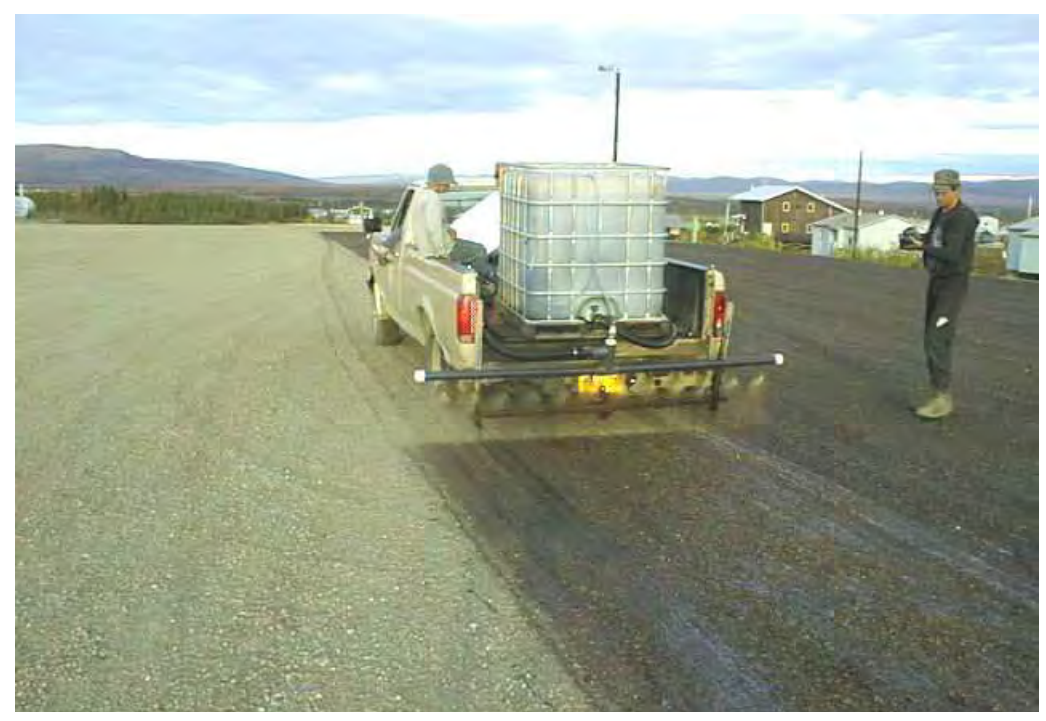
Kiana airport apron. August 2001.