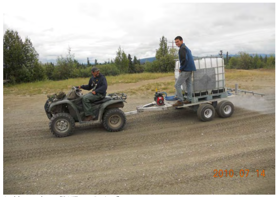
Ambler roadway, "8 Villages Project". "Practice" spraying (water) with Apun sprayer; July 2010