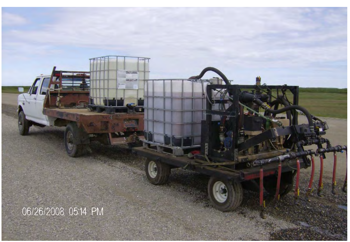
Emmonak airport. Kawarek's sprayer, June 2008.