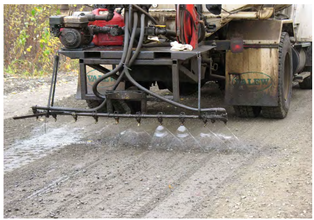
Tanana. Brice, Inc. (airport contractor) Road Work, applying TerraLock in Fall 2007.