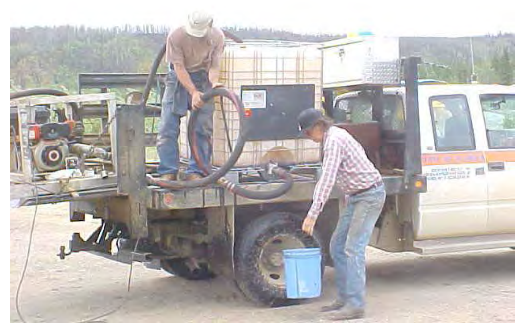
Chicken airport. June/July 2005.