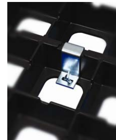
Figure 2 The PadLoc® Connection Device