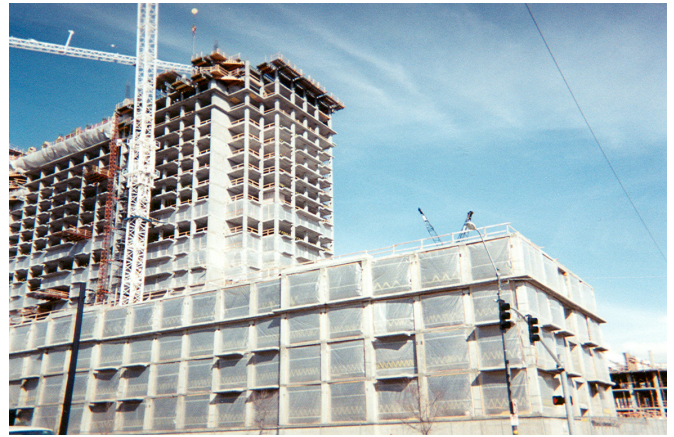
Building Abatement Enclosure

GEO♦SKRIM® 2FR and 10FR are available in a variety of widths and lengths. Panel sizes up to 40,000 square feet are available. All panels are accordion folded and tightly rolled on a heavy-duty core for ease of handling and time saving installation.