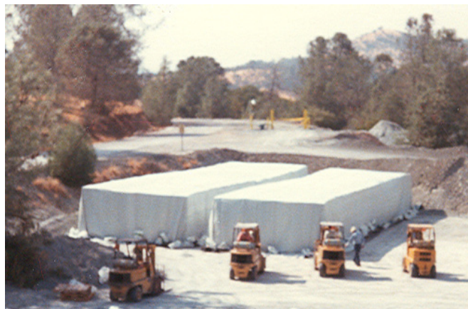
Construction Site Covers

GEO♦SKRIM® 6BB, 6WB & 6WW are available in a variety of widths and lengths. Panel sizes up to 100,000 square feet are available. All panels are accordion folded and tightly rolled on a heavy-duty core for ease of handling and time-saving installation.