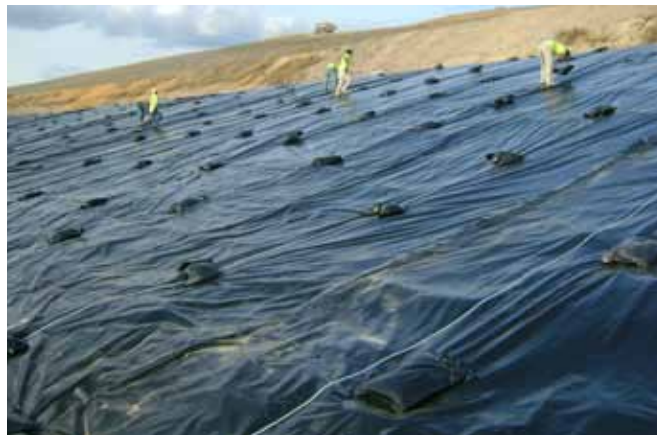
Temporary Rain Shed Cover

GEO♦SKRIM® 8BB, 8WB, are available in a variety of widths up to 125,000 square feet and up to 80,000 square feet in 12BV and 12WB. All panels are accordion folded and tightly rolled on a heavy-duty core for ease of handling and time-saving installation.