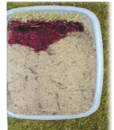
Typical Wetting Agent