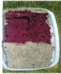
Penetrating Action with Premium Turf Penetrator GT