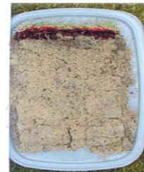
WITH WATER ONLY